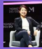
Beh Sheue Chee Travel and Payments Consulting, Singapore