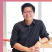
Mox Bank, COO, Mox Bank, Hong Kong