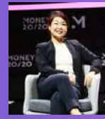
Beh Sheue Chee Travel and Payments Consulting, Singapore